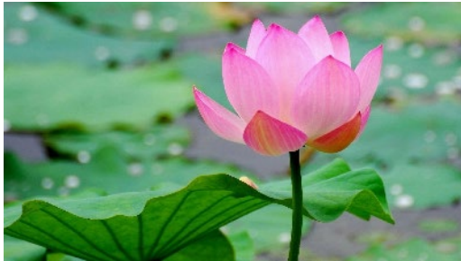
Figure 6. Original image (Source: alamendah.org).