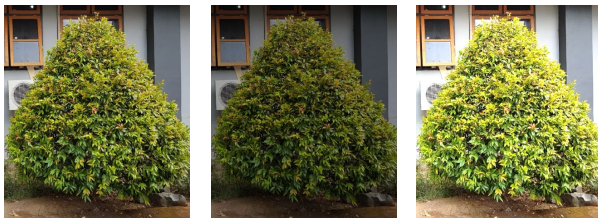
Figure 2. Image with brightness adjustment.