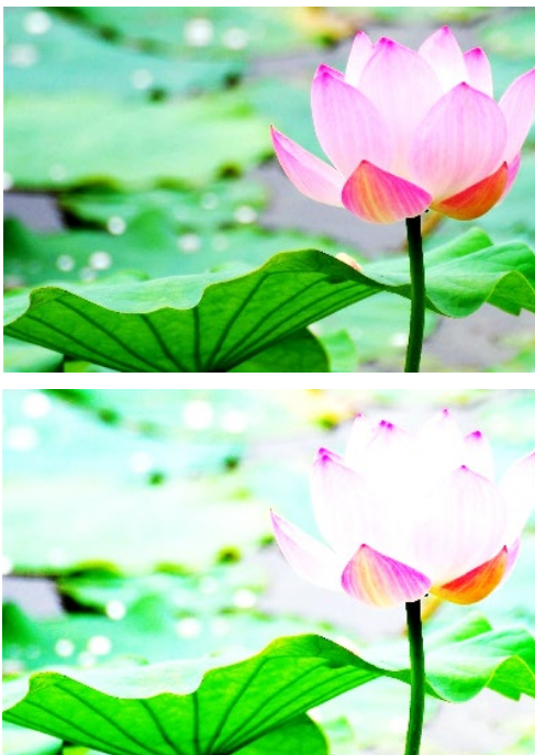
Figure 8. Image with brightness and contrast 20% and 40%.

The next step was important because it applied one or several adjustments or stretching on cropped image by setting the proper brightness and contrast value like the images described in Fig. 8. Perfect brightness, contrast and picture effect made the image more interactive and informative, interesting to see the highlights and the way they bring a presentation into live and attract people attention to be more focus on the topics [4], [6], [10].