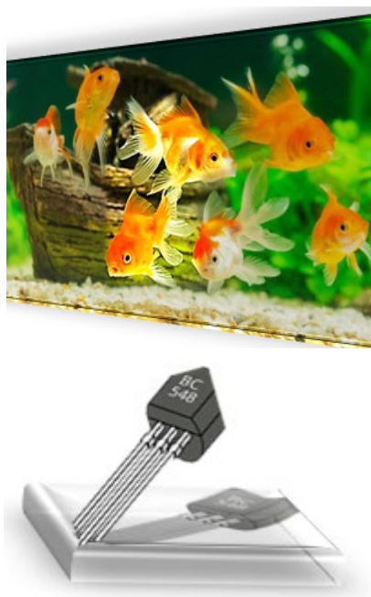
Figure 13. Images that emphasize 3D images with attracting colors and brightness (Source of original images: fullhdwall.com and pngdownload.id).

Fig. 13. Using camera and proper perspective, the images look alive and more beautiful. An image designer or multimedia designer surely can polish these images and make them more attractive.