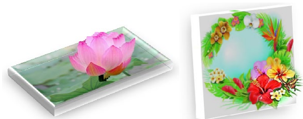
Figure 12. Embossed images with attracting colors and brightness.

Performing an informative image into 3D forms is more catchy and delightful as can be seen in Fig. 12. 3D picture effect should be applied correctly into the step of image processing in order to get the wonderful embossed picture. This is almost like creating real images with virtual reality but in here we are using general tools and software that mostly familiar with users.