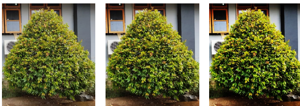
Figure 4. Image with contrast stretching.

Contrast of an image is a distribution of light and dark pixel. Gray scale image with low contrast will look too dark, too light, or too gray. The histogram of low contrast image will show the concentration of all pixels at the left side, right side, or the center. A high contrast image has a wide dark and light area as shown in Fig. 3. A good contrast image will show a wide range of pixel. The