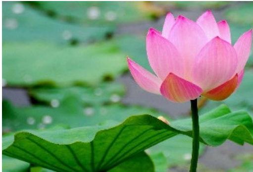
Figure 7. Cropped image.

The next step was important because it applied one or several adjustments or stretching on cropped image by setting the proper brightness and contrast value like the images described in Fig. 8. Perfect brightness, contrast and picture effect made the image more interactive and informative, interesting to see the highlights and the way they bring a presentation into live and attract people attention to be more focus on the topics [4], [6], [10].