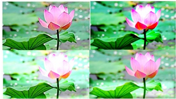
Figure 9. Specific applied features on image.

finishing skill to attach the edited image with the original image so both will be perfectly integrated as one as shown in Fig. 9 to Fig. 11.