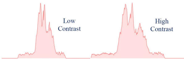
Figure 3. Low contrast and high contrast histogram.