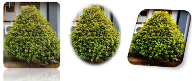
Figure 5. Image with picture effects.

Picture Effect is a feature that polishes an image and gives effects with shadow, reflection, glow, and soft edge. This will help a lot in finishing the result with good blending so we could have a perfect image as we wish [7], [9]. Several picture effects carried out on image are described in Fig. 5.